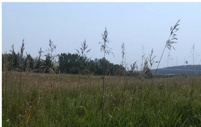
The portion of Bowmont Park being naturalized is currently dominated by smooth brome; a non-native, invasive weed.

2017 invasive weed control: Complete Site preparation: Beginning September 28 Planting and seeding: October 2017, Spring 2018 Project Completion: October 2018